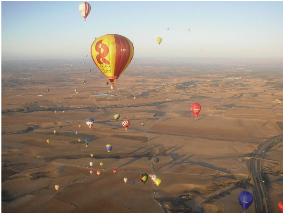
17 th European Championship, Lleida, Spain