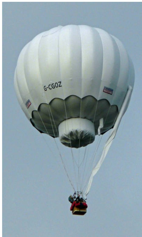
Envelope fully inflated. Filling tube inflated down to bottom of servo.

The maximum pressure in the top of the GB1000 balloon will probably be less than 1.4 hPa and thus less than many other balloons flown for many years in Gordon Bennett races.