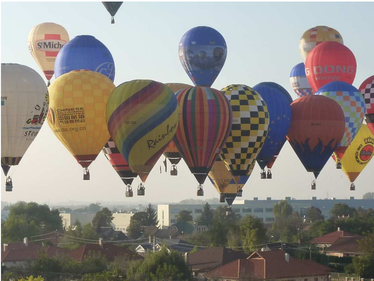
19 th FAI World Hot Air Balloon Championship, Debrecen, Hungary